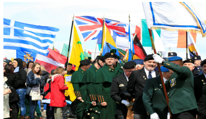
Ireland's first International Festival of Flags & Emblems—'Bratacha 2013' held in May 2013 in Dún Laoghaire Rathdown. Photo: 'Parade of Flags' with hundreds participating.